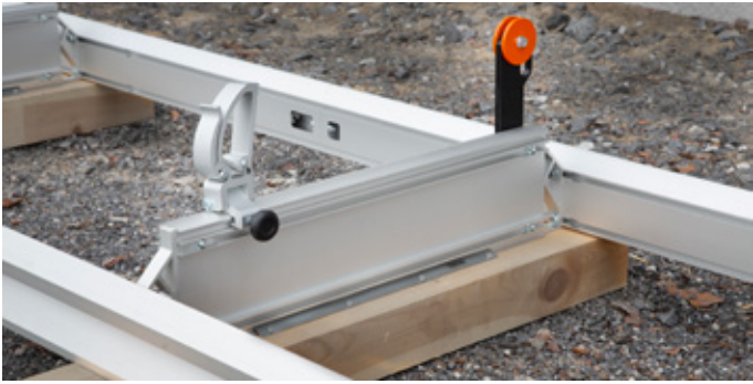
Sturdy log bed with a wide contact surface against the log.