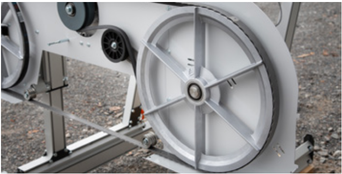
Band wheels with fan blades, cools the blade and keeps the cover clean.

Whether you want a petrol engine to move the mill between different sites, or you prefer the quiet operation of an electric motor, we offer two great options: