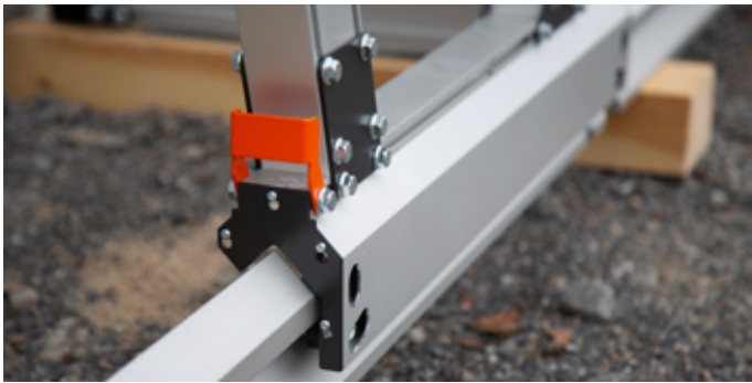
The saw carriage glides easily on the rail, completely free of play.

The B701 is a “low-tech” sawmill—in the best sense of the word. The construction is easy to understand, intuitive to use, and built to last. With few things that can go wrong, ownership easy and hassle-free—it just works, year after year.