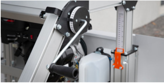
Smooth feel in the hand crank, adjustments are quick and effortless.

The heavy-duty band wheels are borrowed from our larger models. They double as fan blades, clearing sawdust from the blade covers and cooling the blade efficiently. The band wheels are fully adjustable for perfectly straight cuts. The saw carriage is easily locked in place for blade changes. These are details that make a real difference in daily use.